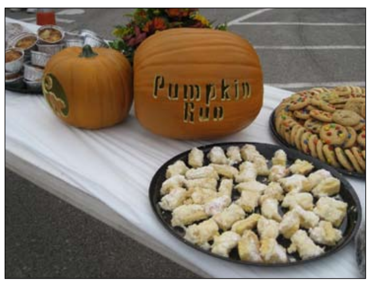
Tables of goodies await participants of Pumpkin Run/Walk.

The first 1,000 registered participants to pick up race packets receive a classic long sleeve t-shirt. Shirt sizes will be on a first come, first served basis.