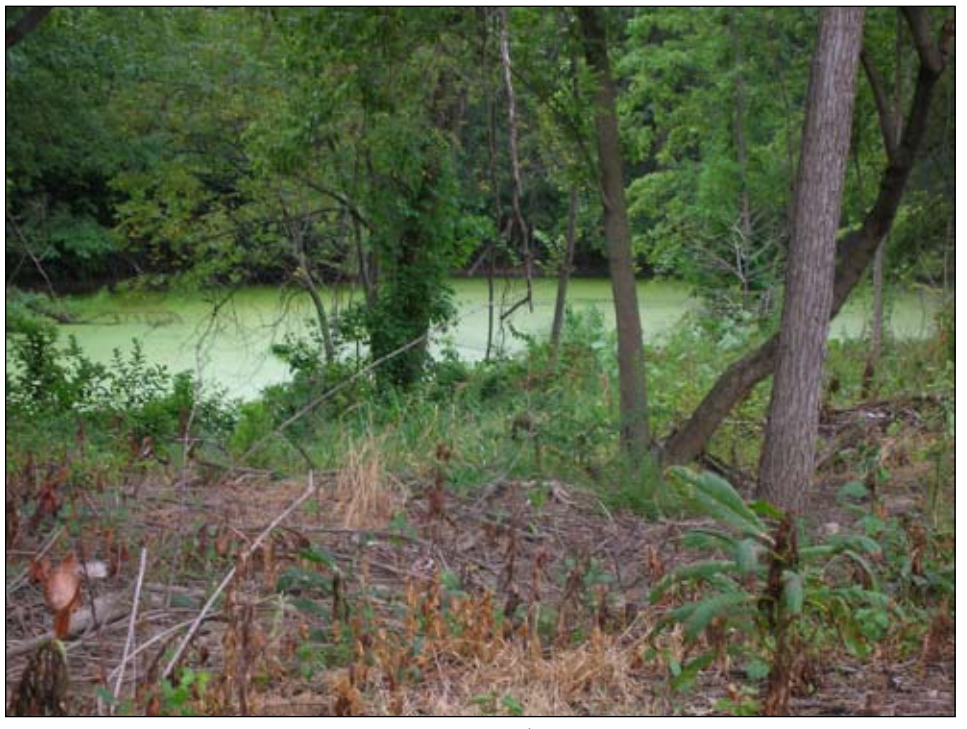
Volunteers are needed to help install native plants Oct. 15 on sections of the riparian such as this.

The Missouri Botanical Garden/Shaw Nature Reserve, the Missouri departments of Conservation and Agriculture/Grow Native!, and the St. Louis Chapter of the National Wild Ones, chose the Neal Rose family in Bridle Creek subdivision for a front yard makeover. Up to $1,500 native flora and other landscape materials will be installed in the Rose yard, starting this September.