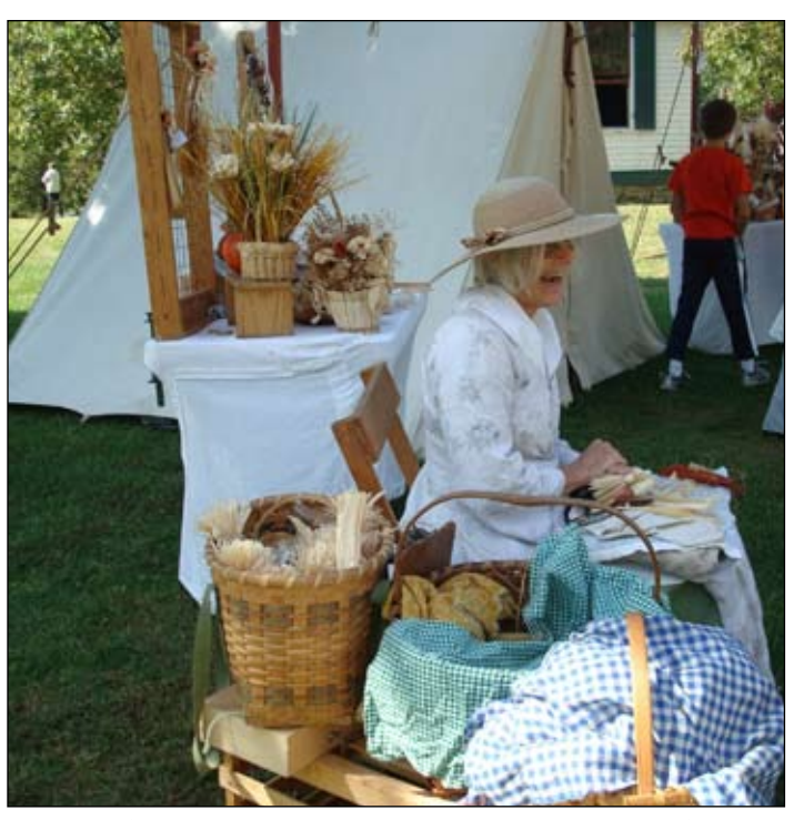
Examples of corn silk art are among the exhibits at the Faust Park festival.