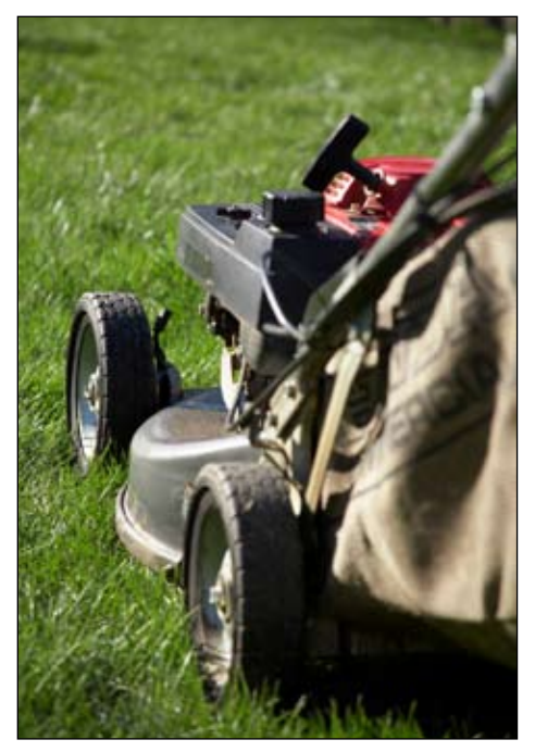
mower. Leaves will block sunlight from reaching the grass blades so don't allow a buildup on the lawn.

When the leaves start falling, be sure to remove them from the lawn or mulch them with a mulching