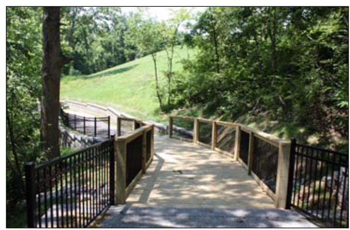
Boardwalks enhance the newly opened Riparian Trail, which winds for a half mile along a stream through natural surroundings.

Phase 1 of the Trail can be accessed from the south side of Lydia Hill Drive near the intersection of Veterans Place Drive. The trail entrance can be found on Lydia Hill Drive, directly across from the new Veterans Place Drive. Parking is available in the Family Aquatic Center parking lot.